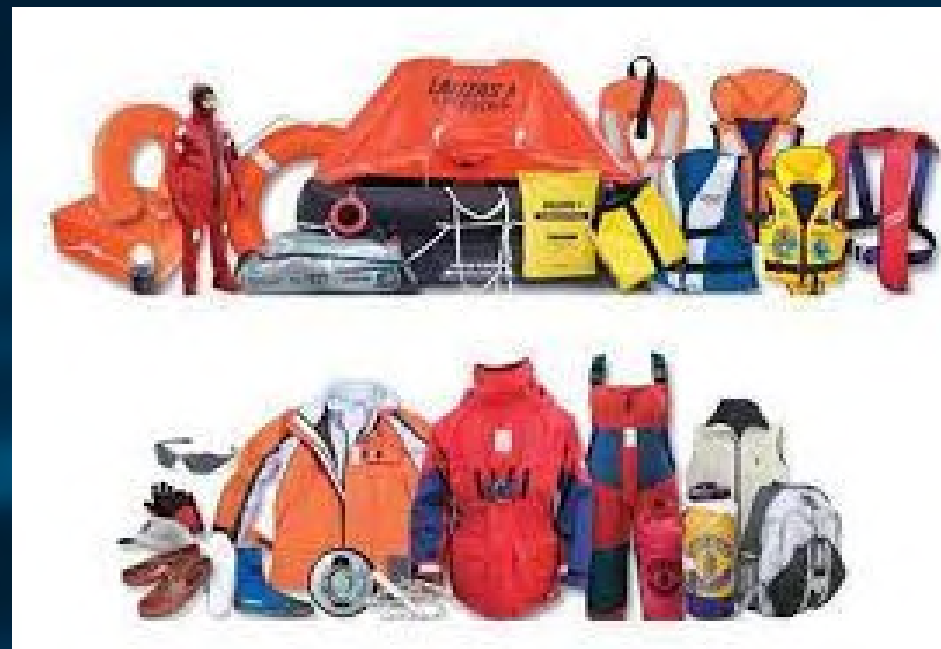
SAFETY EQUIPMENT & CLOTHS