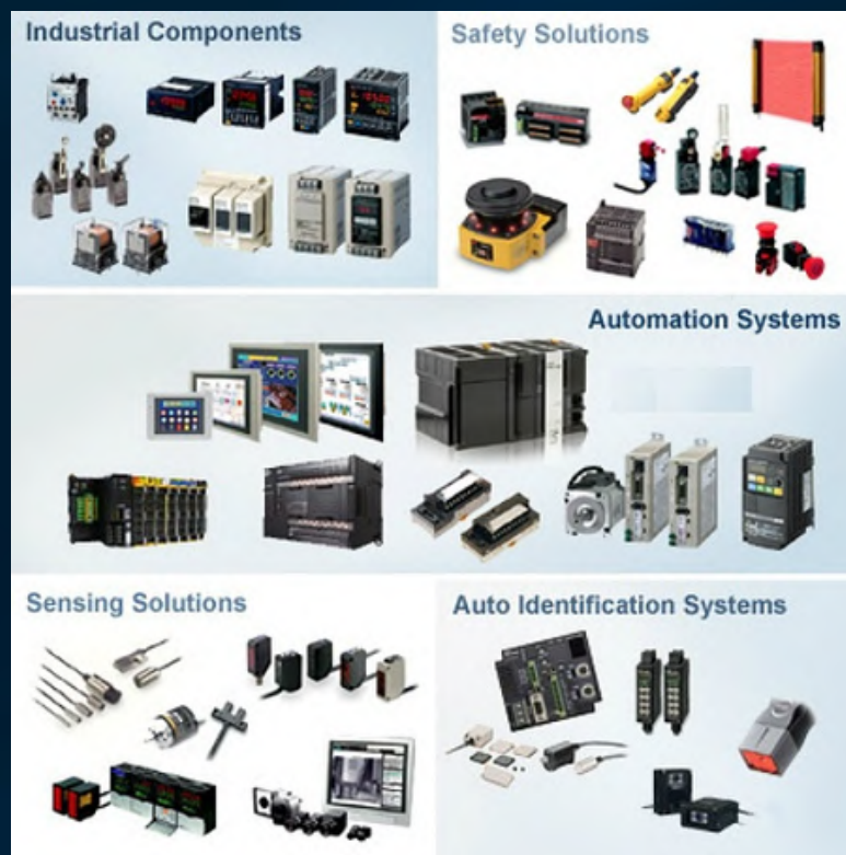
ELECTRICAL & AUTOMATION SPARES