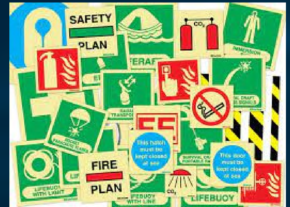
SAFETY SIGNS AND POSTERS