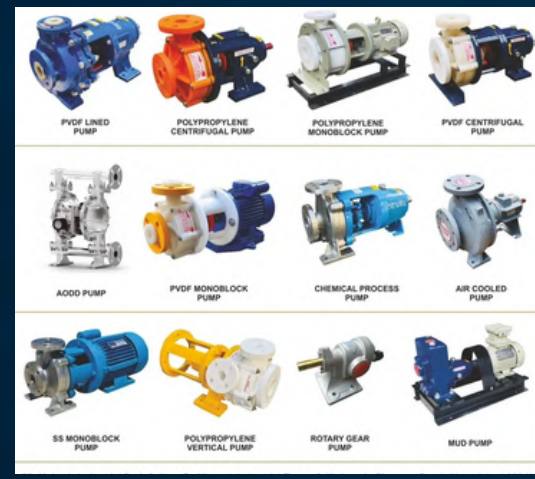
CHEMICAL PUMPS & SPARES