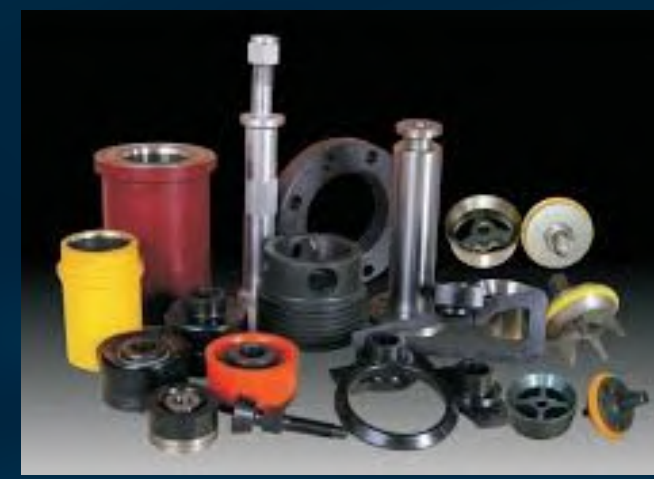
MUD PUMPS & SPARES