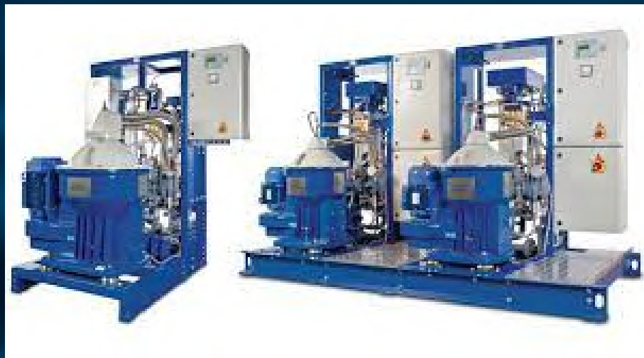
ALFA LEVELS MACHINERIES