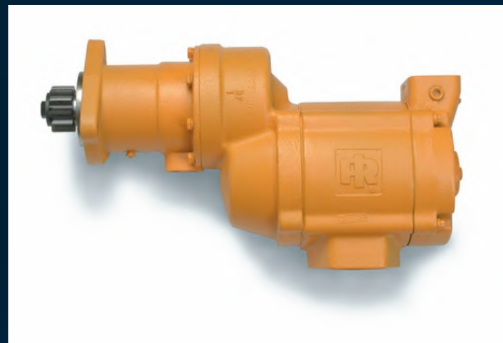
AIR MOTOR STARTERS