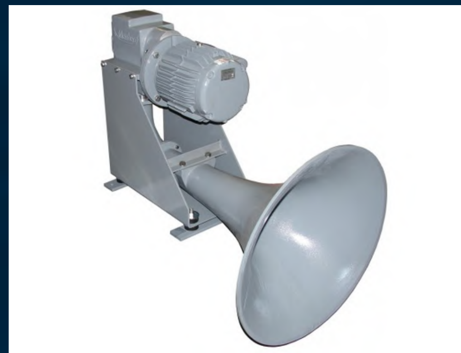
PISTON HORN / AIR HORN